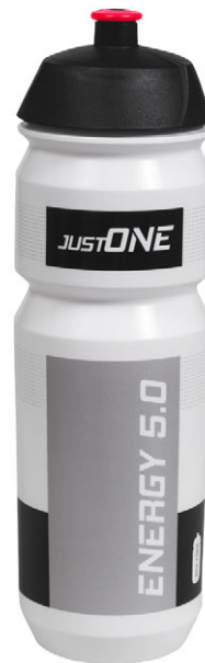
180491 white | black