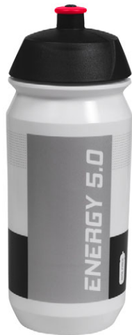
180391 white | black