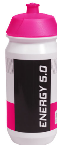
180394 white | pink