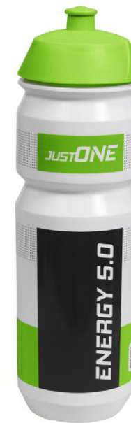
180498 white | green