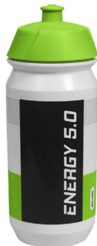
180398 white | green